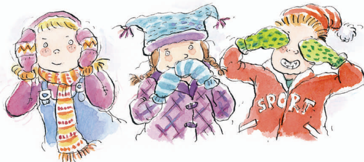
Illustration copyright © 2007 by Mitch Vane

MITTENS, MITTENS, MY, OH, MY! A MOUNTAIN OF MITTENS, PILED UP HIGH